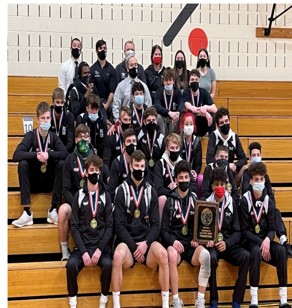
Delaware Valley Warriors Wrestling Camp 2021

1st-8th Grade June 28-July 1 9:00am- 2:00pm